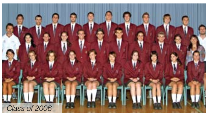
Class of 2006