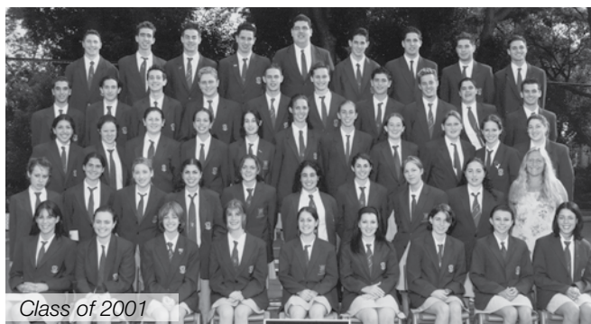
Class of 2001