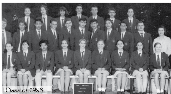
Class of 1996