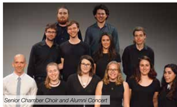
Senior Chamber Choir and Alumni Concert