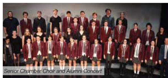
Senior Chamber Choir and Alumni Concert