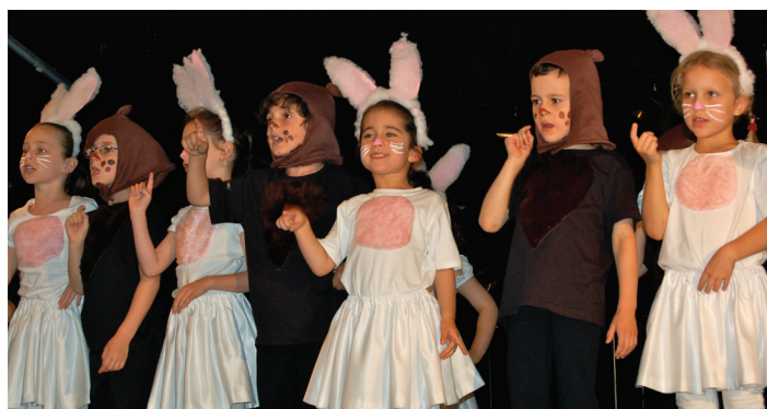
Scene from the recent Primary School concert, Cinderella & Rockerfella