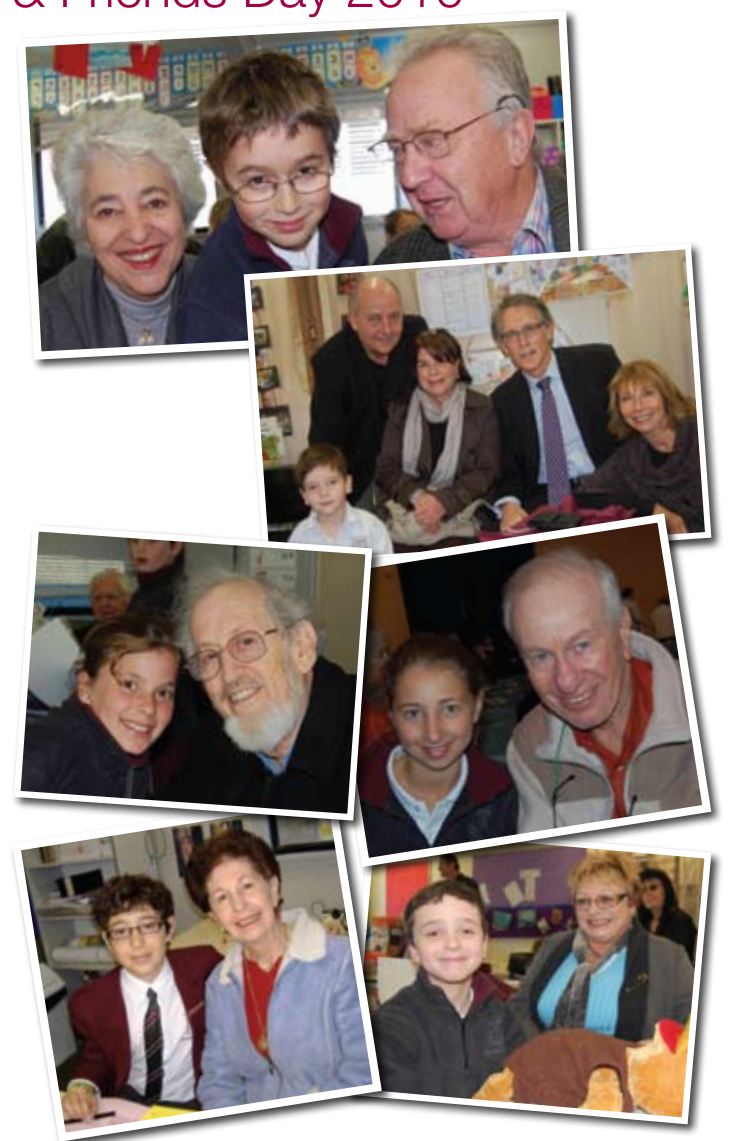
All of the pictures featured on this page, were taken at the 2010 Grandparents and Friends' Day. – 18 August 2010

Snapshots from Grandparents & Friends Day 2010