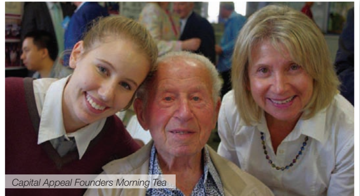
Capital Appeal Founders Morning Tea