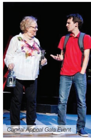
Capital Appeal Gala Event