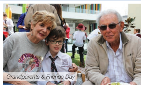
Grandparents & Friends Day