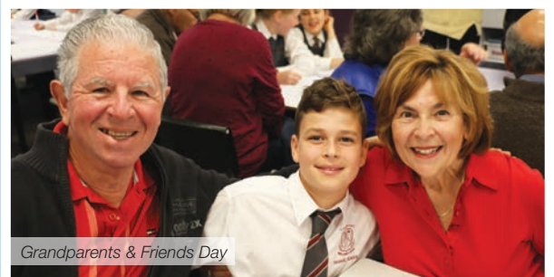
Grandparents & Friends Day