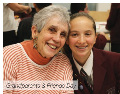
Grandparents & Friends Day