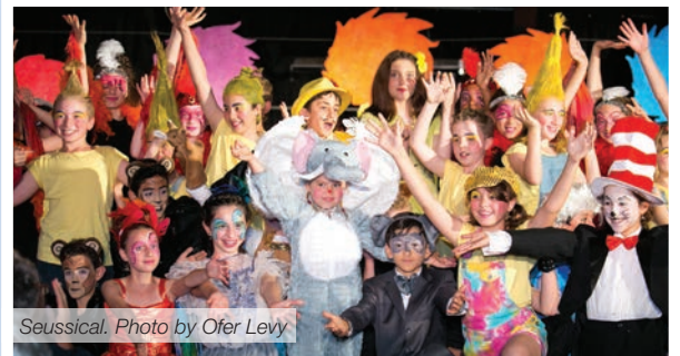
Seussical.