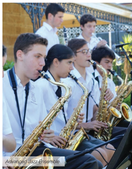
Advanced Jazz Ensemble