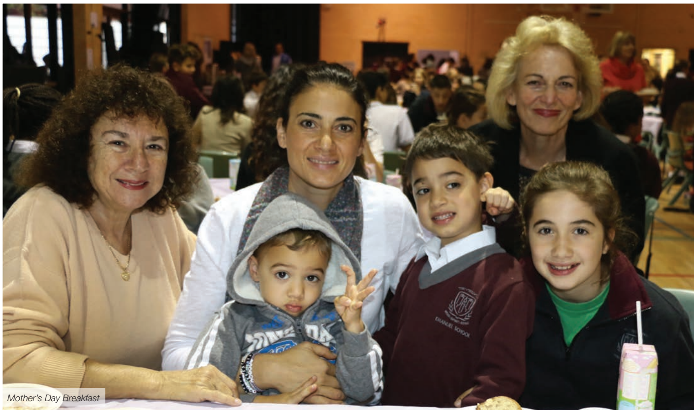
Mother's Day Breakfast