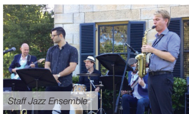
Staff Jazz Ensemble