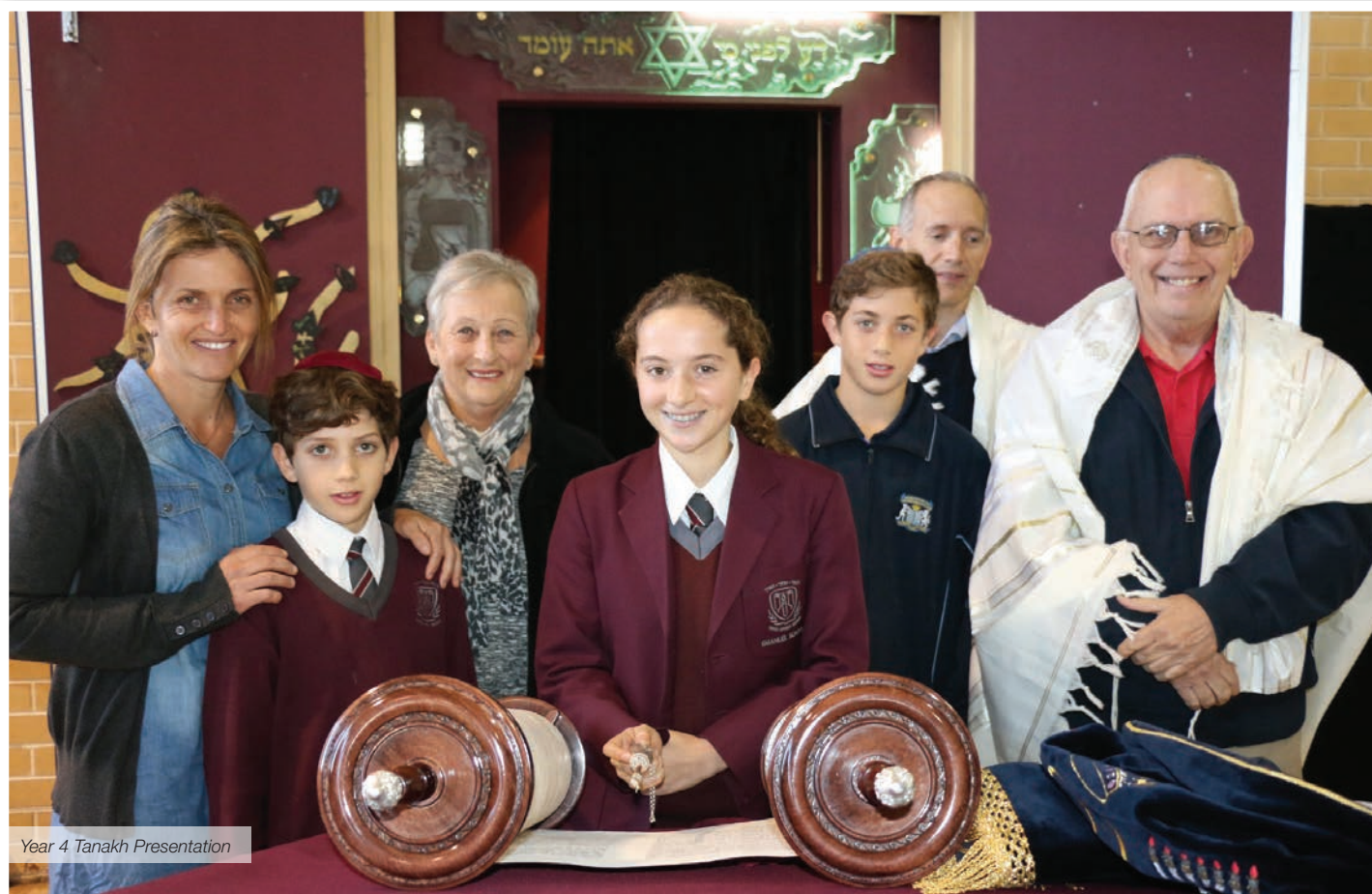
Year 4 Tanakh Presentation