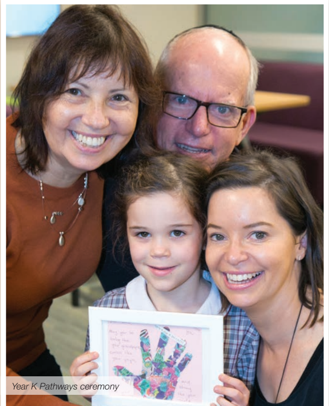
Year K Pathways ceremony