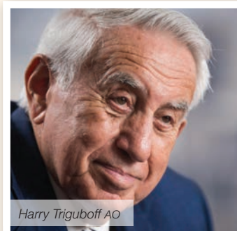
Harry Triguboff AO