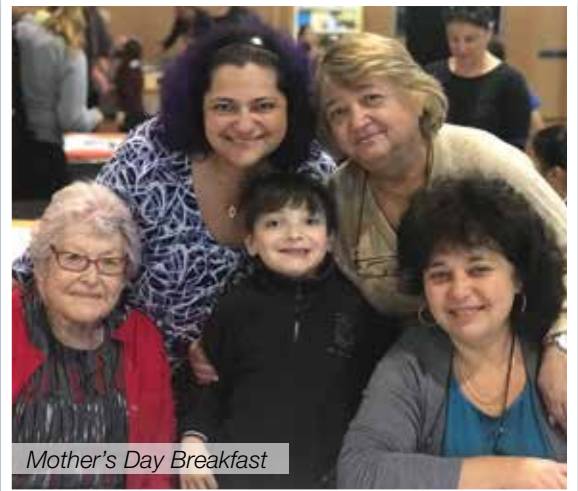
Mother's Day Breakfast