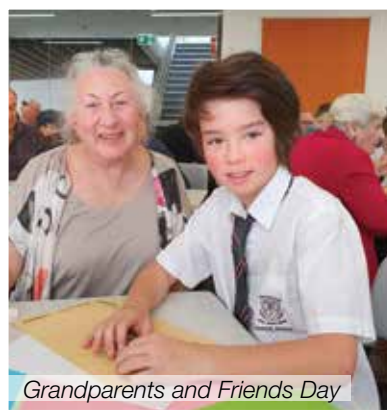
Grandparents and Friends Day