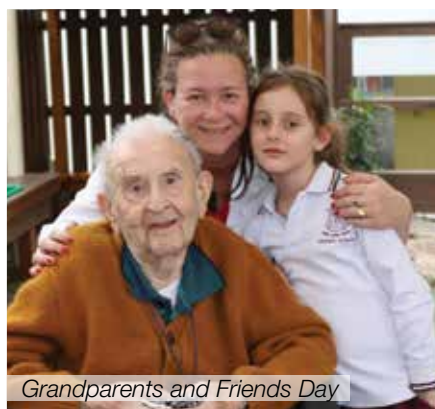
Grandparents and Friends Day