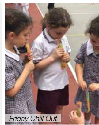
Friday Chill Out